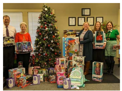
CASA Toy Donation Main Office

Monetary donations were made to Care and Share, CASA of the Pikes Peak Region and Springs Rescue Mission in 2023.We also donated winter coats to a local elementary school and piles of toys to CASA, Hope & Home and the Woodland Park Community Partnership toy drive. We look forward to continuing our culture of giving in 2024.